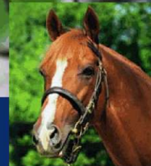
Sky Classic Nijinsky II - No Class