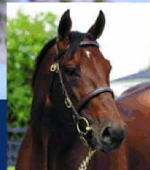
Broken Vow Unbridled - Wedding Vow