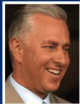
Todd Pletcher , Trainer

"From his very first works he showed us he was a horse of the highest class. He had great tactical speed and a marvelous will to win. He's a Grade 1 winner at 2 and 3 and is also a very correct horse. I have no doubt he will go on and make his name as a top stallion."