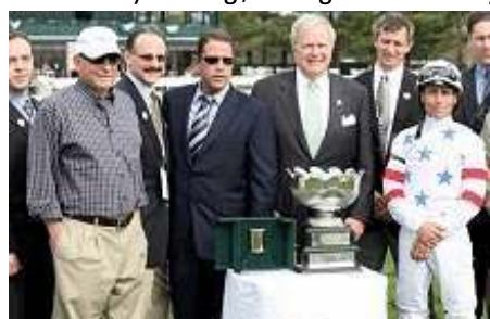
Beaumont Trophy Presentation